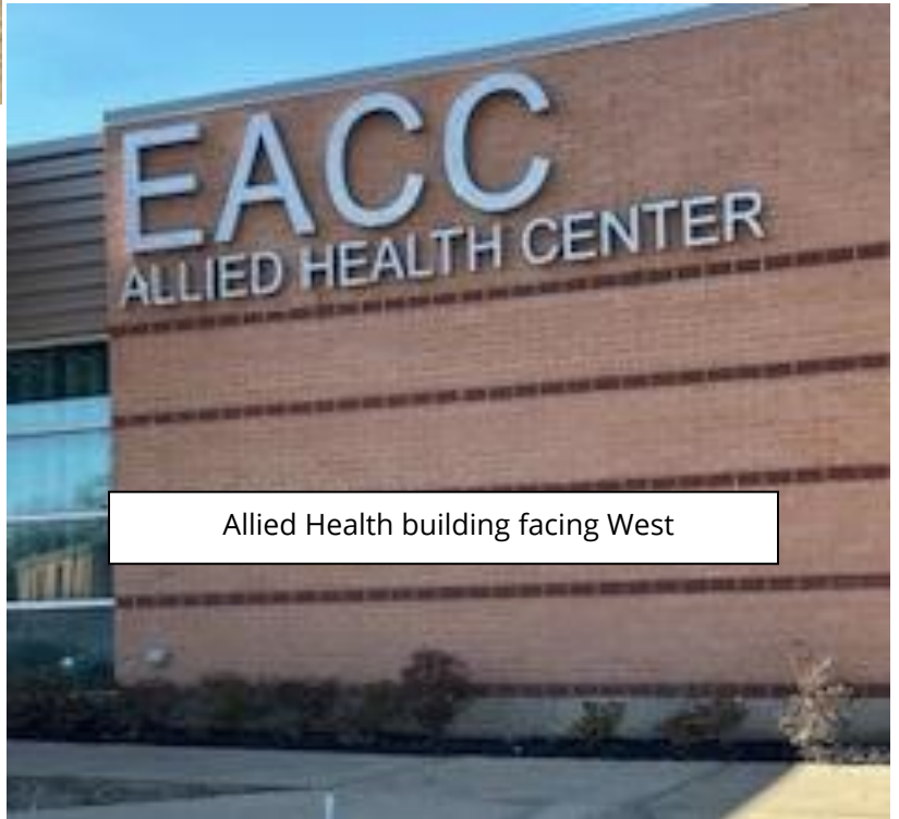
Allied Health building facing West