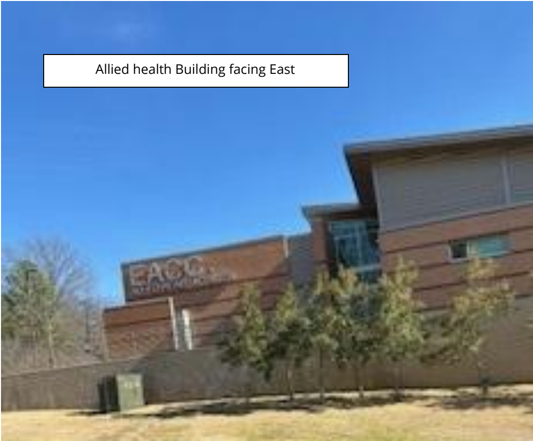
Allied health Building facing East