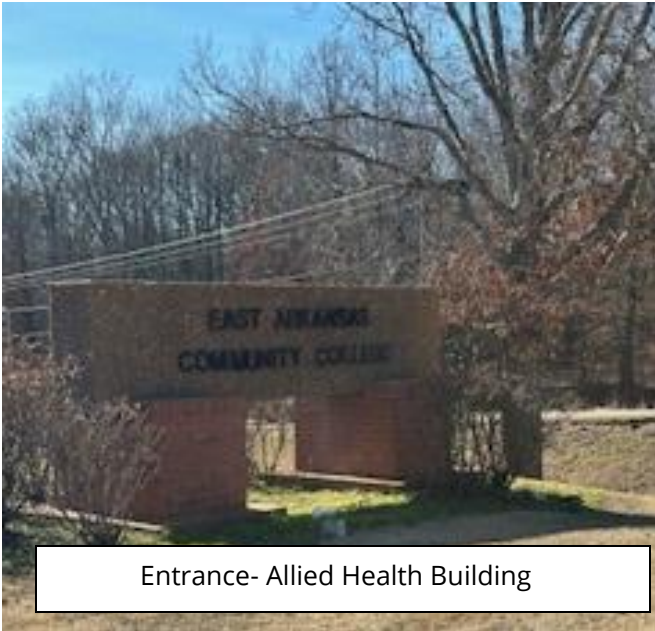
Entrance- Allied Health Building