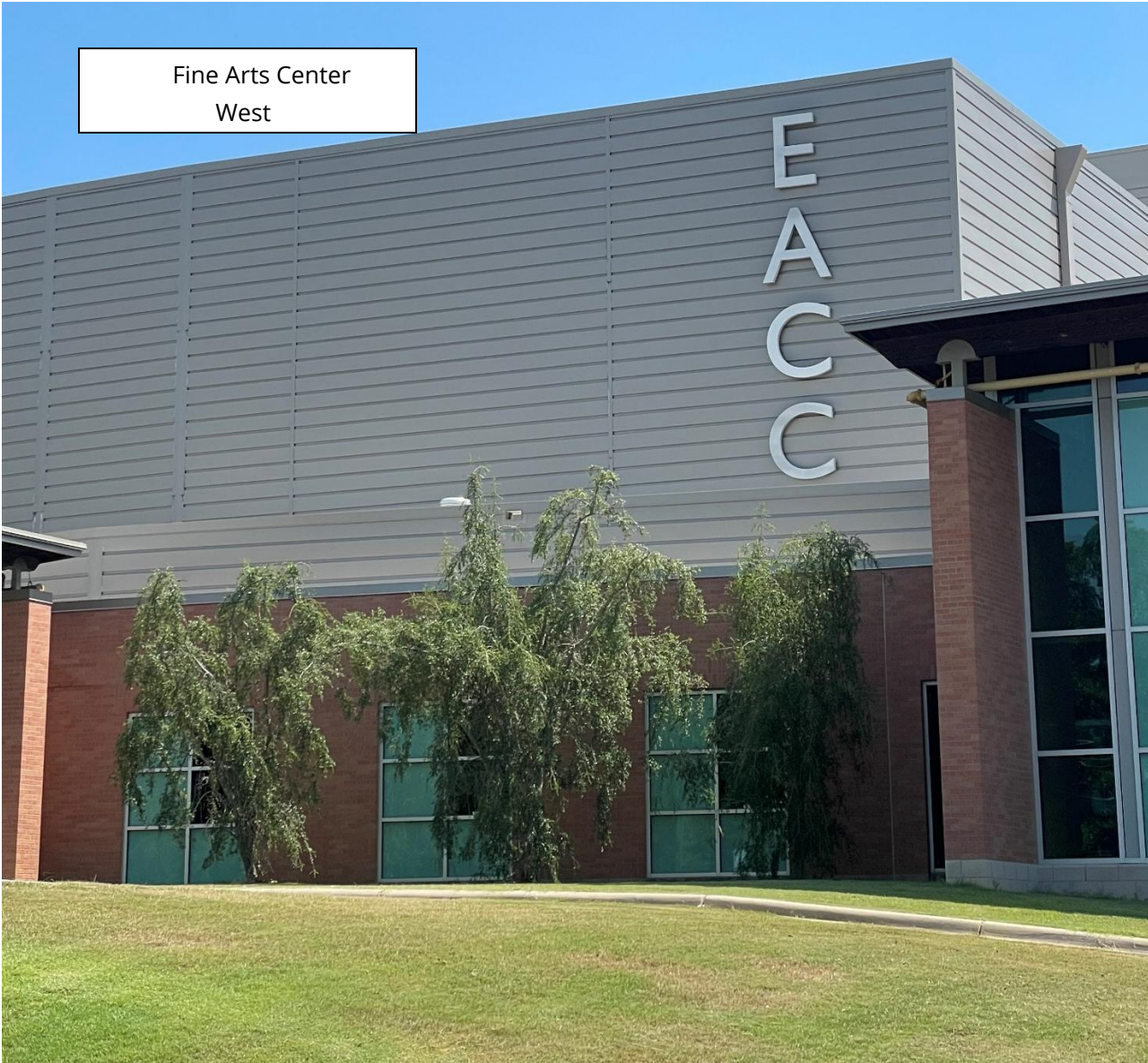
Fine Arts Center West