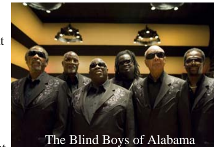
The Blind Boys of Alabama

The EACC Fine Arts Center presents The Blind Boys of Alabama with special guests Sara and Sean Watkins on Thursday, November 10 at 7:00 p.m.