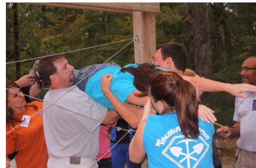
The Newport Group participating in the 'Spiderweb Element' Exercise