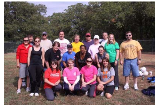
Newport Chamber of Commerce 'New Vision' Leadership Class

The Adventure Training Center provides the ultimate training experience for building a successful team and improving self confidence. For more information contact the Director of Continuing Education at 870-633-4480 ext. 289 or 347.